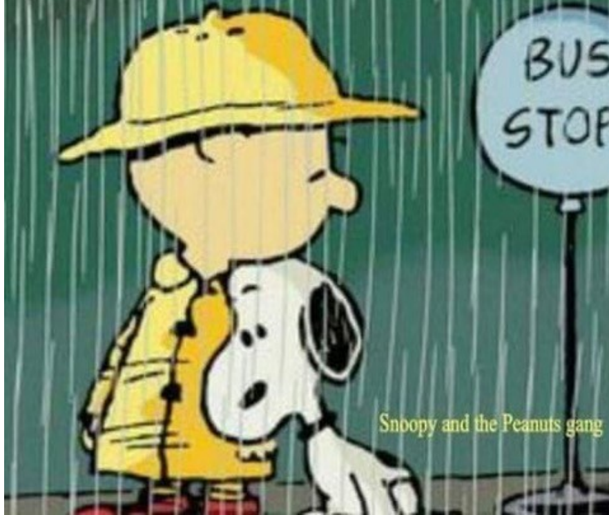
Snoopy and the Peanuts gang

Remember, anyone can love you when the sun is shining. In the storms is where you learn who truly cares for you.